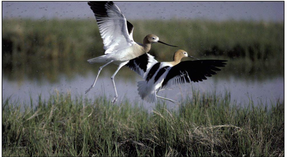
American Avocets at Bear River Migratory Bird Refuge, Utah

At Bear River Migratory Bird Refuge , inadequate funding hinders efforts to properly control water levels in 25 impoundments. The budget cuts will also hamper monitoring efforts as well, such as for water contaminants and migratory bird populations.