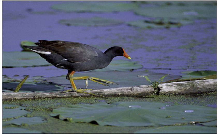
Common Moorhen, Nebraska

Along the river, Boyer Chute Refuge restored nearly 2,700 acres of grassland. Most of this acreage will be re-seeded with a greater variety of seeds to make this habitat more valuable for all grassland-dependent species.